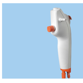
The ergonomic and lightweight handle is designed to give you a firm and comfortable grip