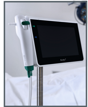
Ambu® aScope™ 4 Broncho Regular and Ambu® aView™