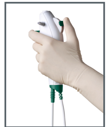
The ergonomic and lightweight handle is designed to give you a firm and comfortable grip